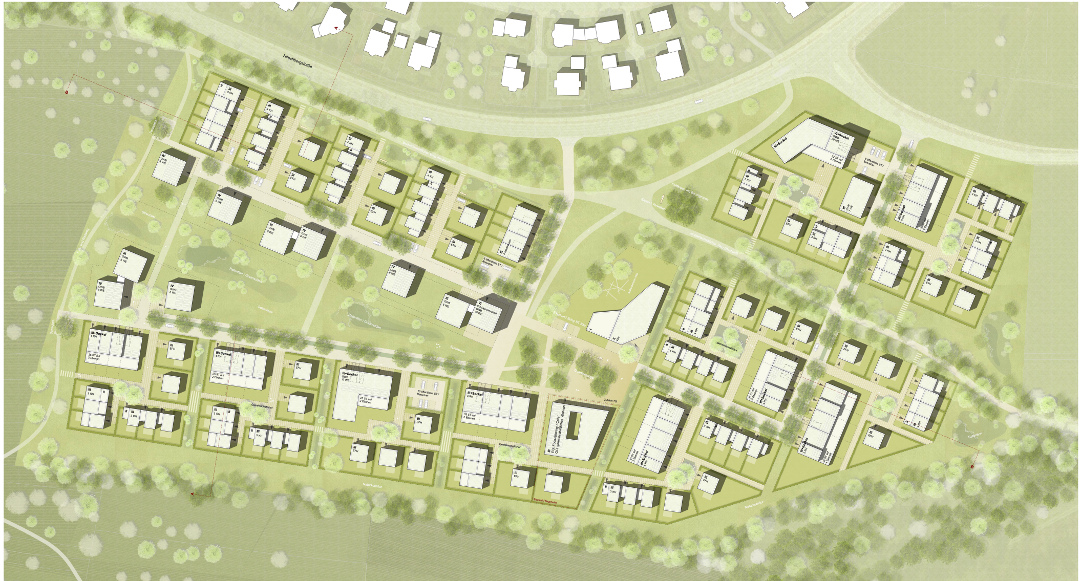
Lageplan M. 1:500